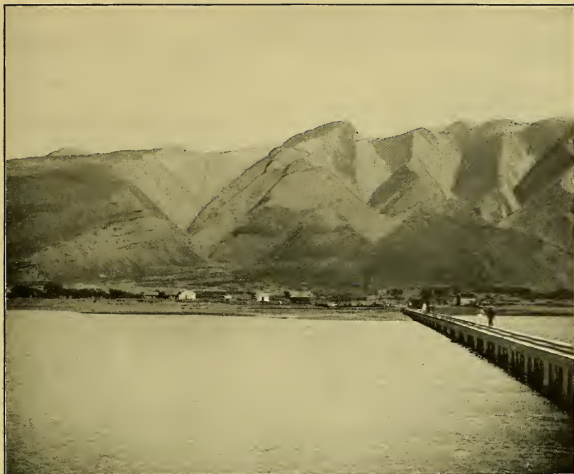
A. KAMALO GULCH, SOUTH COAST OF MOLOKAI.

Showing parts of surface of volcanic cone, deeply dissected by gulches, débris fans at mouth of gulches, and coral reef below shallow water near shore.